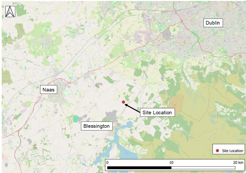
Figure 1-1 - Regional Site Location